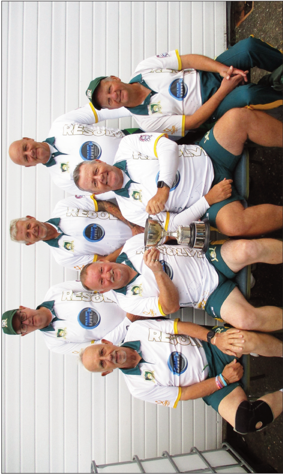
West Glamorgan Double Fours Champions 2023 (Resolven)