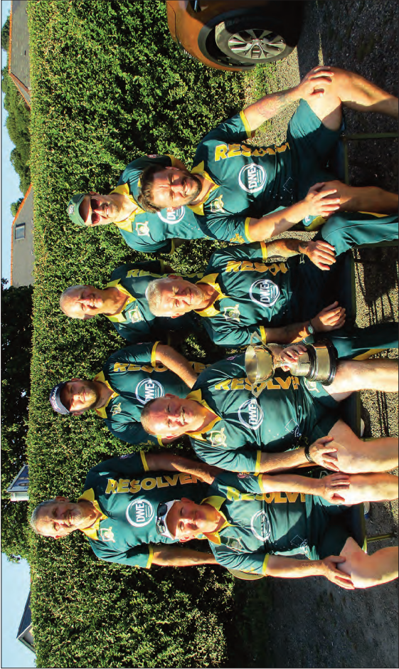
West Glamorgan Double Fours Champions 2025 (Resolven)